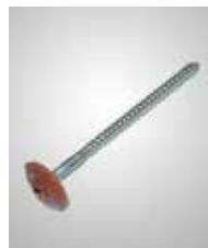
Plumbing screws, color coated