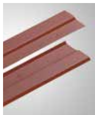
WK wall connection bar