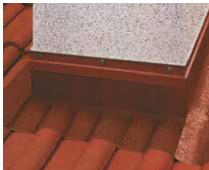
Overlapping adhesion without any problem.