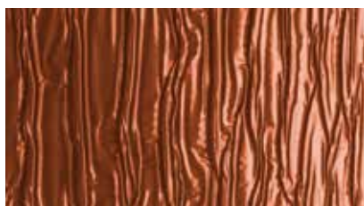
WK-Alu Stretch detailed view of top.

Easy. Fast. Permanent. WK-Alu Stretch does not need any special tools. Apart from a tape measure, pencil and scissors, you only require a rubber pressure roller. WK-Alu Stretch is cut to the corresponding length using scissors and laid out roughly following the course of the roof. After pulling the covering film off the adhesive layer on the back, the material is pressed on. Once you have fixed the position, continue pulling off the covering film gradually, press the material down and stretch it up to 60%, if required. The side joints are now firmly pressed down using the pressure roller. WK-Alu Stretch tapes can also be bonded on top of one another. When doing so, make sure that the aluminium is pressed smoothly onto the overlapping adhesion point with the pressure roller and is tightly joined to the substrate. Corner areas must be sealed with particular care. After adhesion of WK-Alu Stretch, the surface of the material is fixed with a standard aluminium rail, which should be firmly doweled and sealed with a permanently elastic sealant.